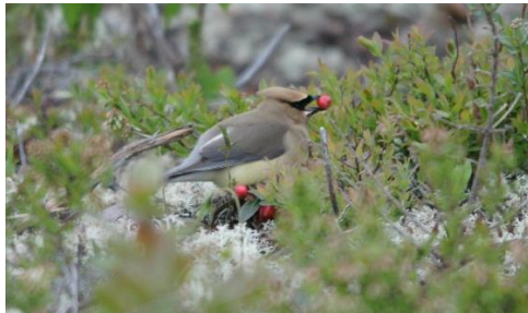
Take a chance! ☺

Summer, 2016, and the Fern Ridge Gang went to Guysborough, NS to install an eco-landscape and came back, and went down and came back... and so on. This resulted in upgrading an incredibly biodiverse 120-year-old mill pond. Along the way, we visited a litany of botanical gardens... and more. We've been told the replay is quite fascinating.